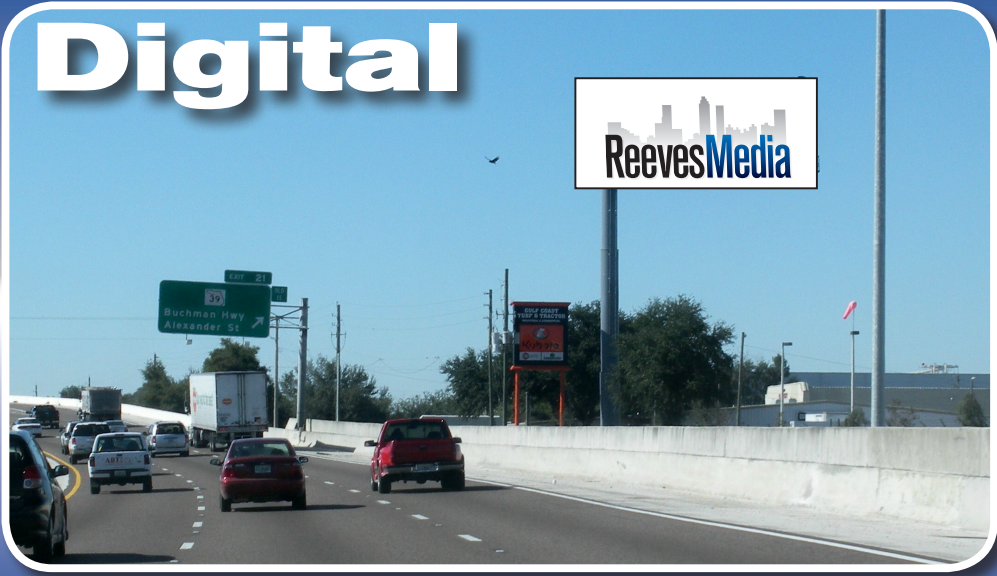
NORTH SIDE OF I-4, 100 FEET EAST OF HWY 39, FACING EAST FOR WESTBOUND TRAFFIC HEADING TOWARD TAMPA/ST. PETE/ CLEARWATER. RIGHT HAND READ.

DIGITAL BULLETIN NUMBER: TAMPA, FL PO103E